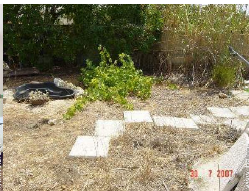
Outside at the guests disposal