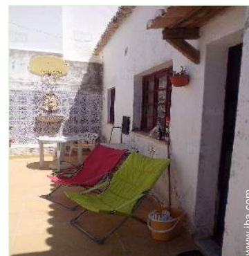
view from the patio

Village center 165' Bus stop / bus station 165' Bike/mountain bike hire <165' Boat rental 0.3mi. Scuba diving material hire 0.3mi. Household linens for hire/laundry services 165' Local stores <165' Supermarket <165' Mail office 660' Bank 660' ATM 660' Drugstore 0.5mi. Doctor 0.5mi.