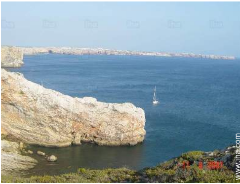
Attractions and relaxation