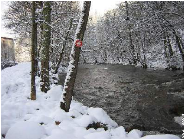
view over the river