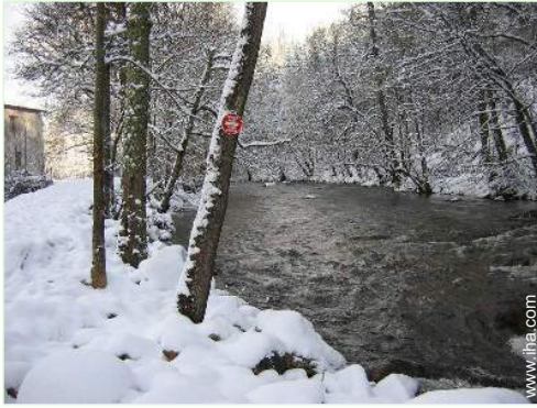
view over the river