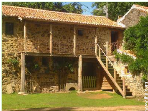
Charming Country House