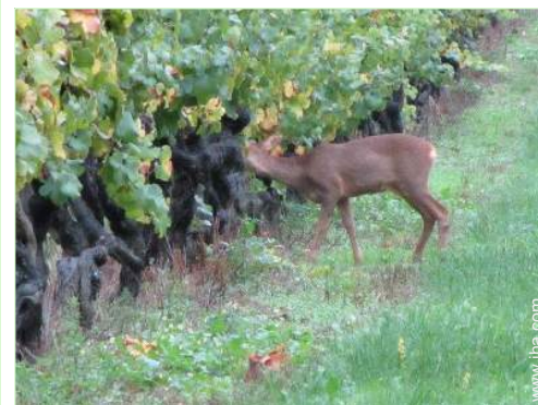
View from the property

Village center 1.25mi. Downtown 6mi. Bus stop / bus station 6mi. Car rental 2.5mi. Breadstore 6mi. Local stores 6mi. Supermarket 4.5mi. High class retailers 4.5mi. Hairdressing salon 4.5mi. Internet cafe 4.5mi. Mail office 4.5mi. Bank 4.5mi. ATM 1.85mi. Drugstore 6mi. Doctor 4.5mi. Hospital 4.5mi. Dispensary 4.5mi.