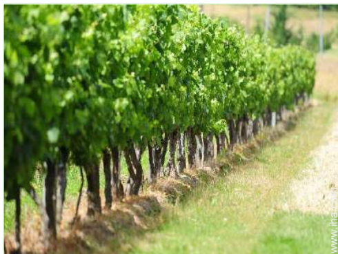
View from the property