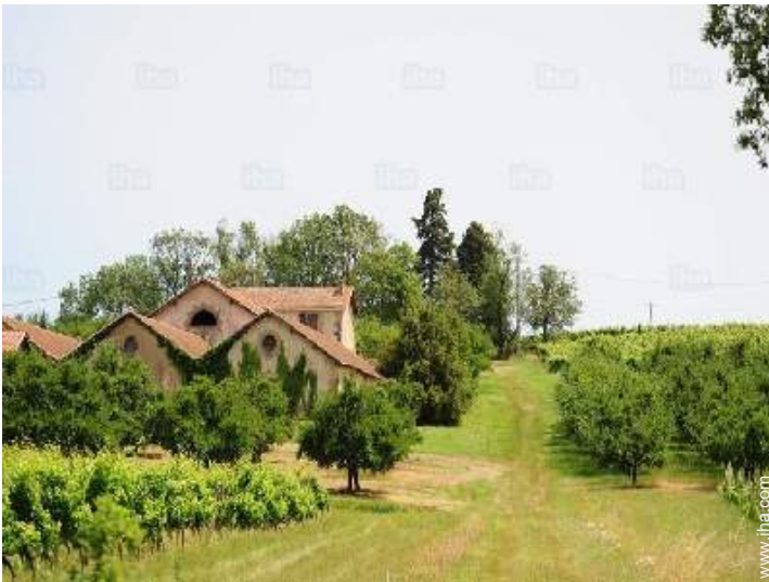
View from the property