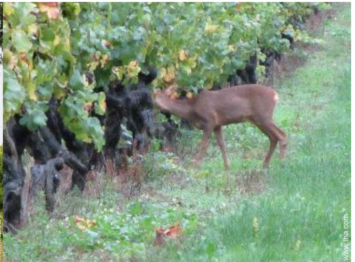
View from the property