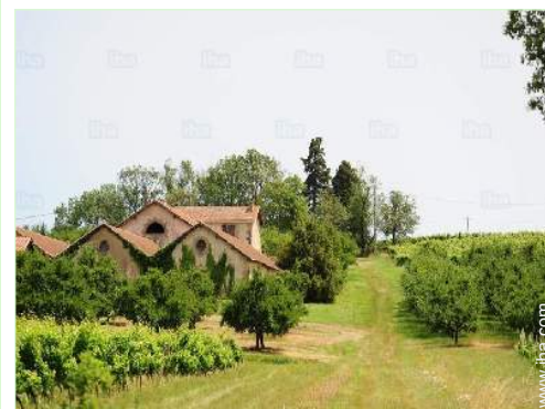
View from the property