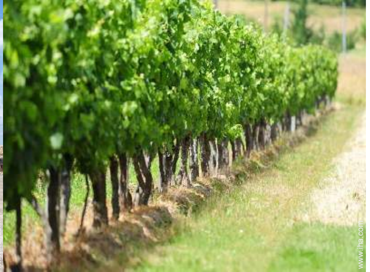
View from the property