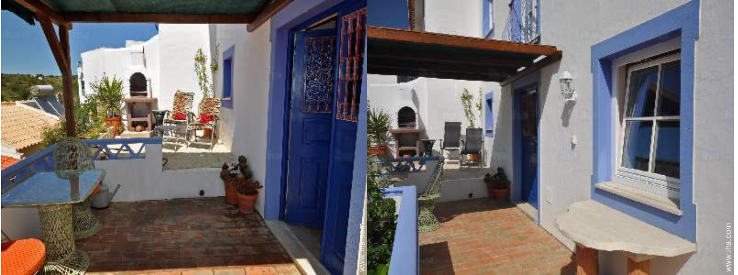
Exterior facilities at guests disposal