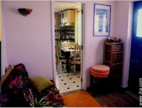
Luxury Studio Flat