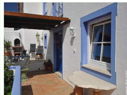
Exterior facilities at guests disposal