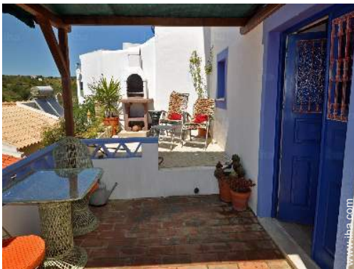
Exterior facilities at guests disposal