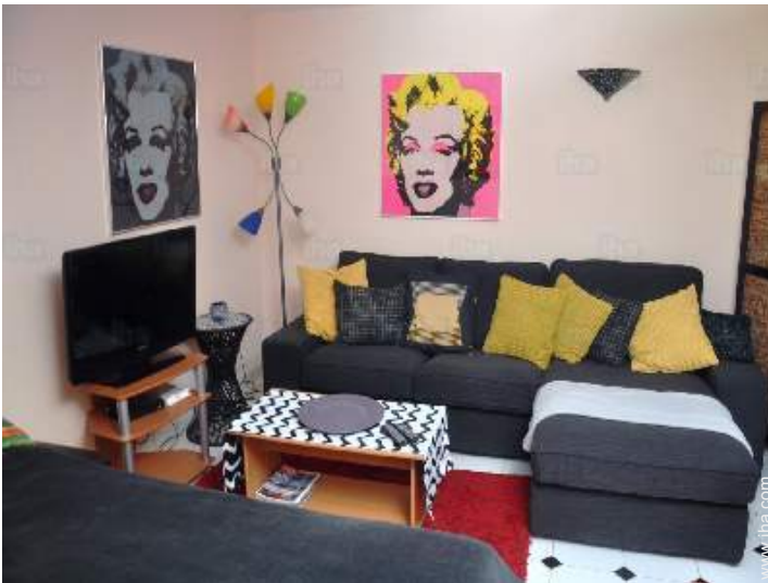
Guest facilities and furnishings