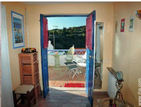
Luxury Studio Flat