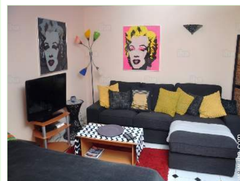
Guest facilities and furnishings