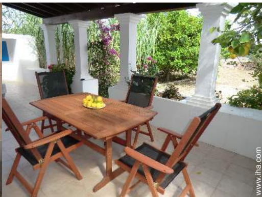
Charming Typical House