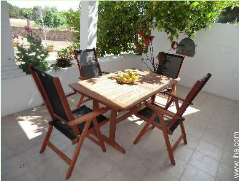
view from the veranda