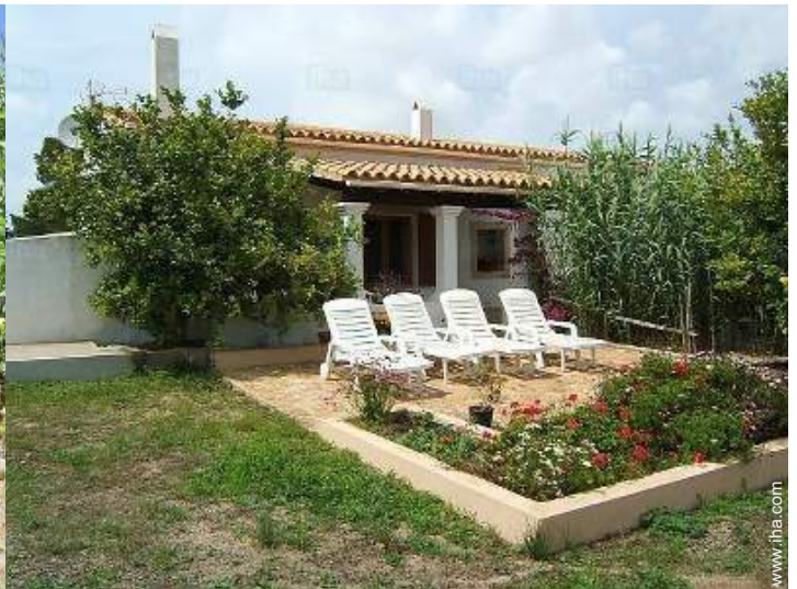
Single family home