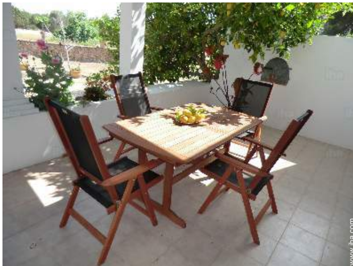
view from the veranda