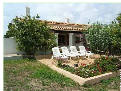
Single family home