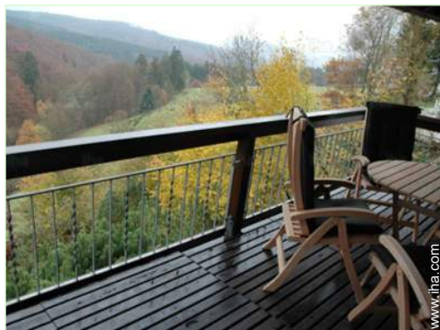
view over the forest