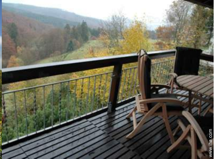
view over the forest