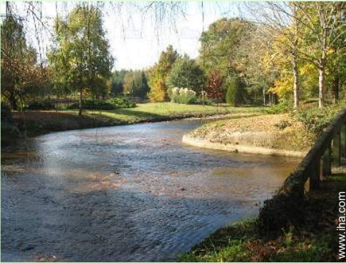
view over the river