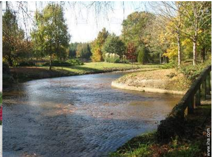
view over the river