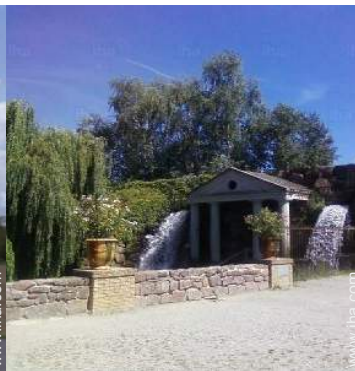
Attractions and relaxation