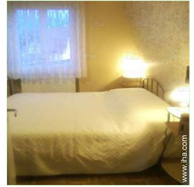
two twin beds