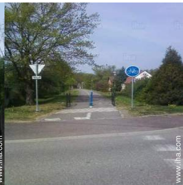
mountain bike (path)