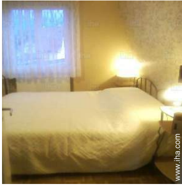
two twin beds