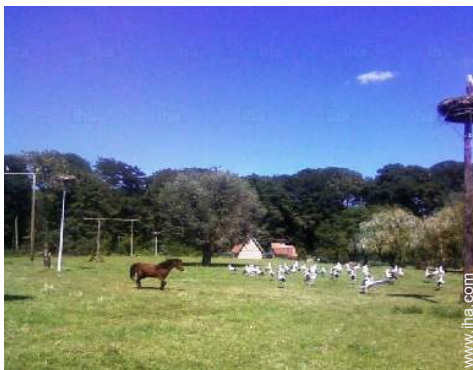
park and garden