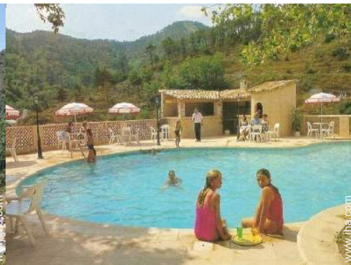
shared swimming pool