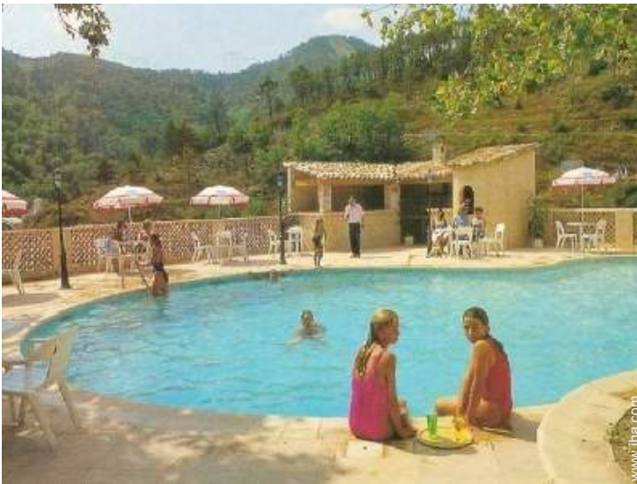
shared swimming pool