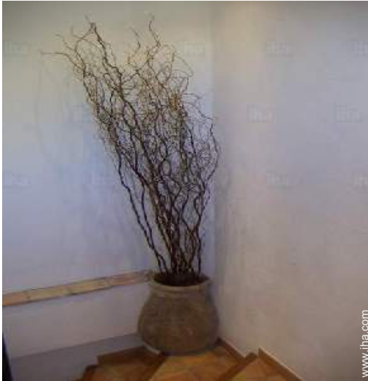
the apartment house/building