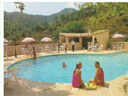
shared swimming pool