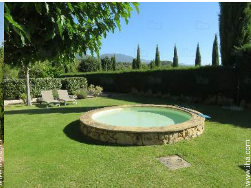
Round swimming pool