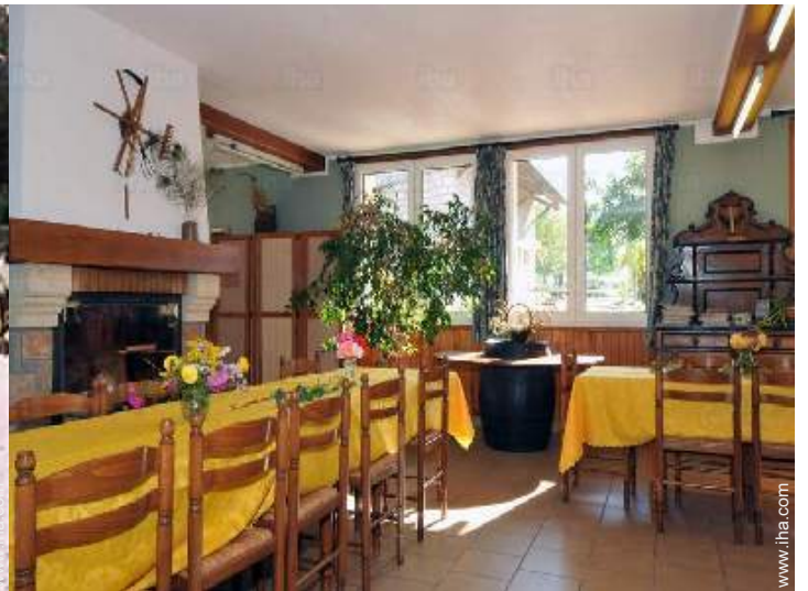
view from the dining-room