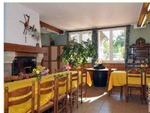
view from the dining-room

Village center <165' Downtown 6mi. Bus stop / bus station 6mi. Bike/mountain bike hire 6mi. Car rental 6mi. Household linens for hire/laundry services 6mi. Breadstore 6mi. Caterer 6mi. Local stores 6mi. Supermarket 6mi. Hairdressing salon 6mi. Mail office 6mi. Bank 6mi. ATM 6mi. Drugstore 6mi. Doctor 6mi. Nurse 6mi. Hospital 6mi.