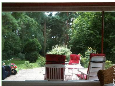
view from the living room