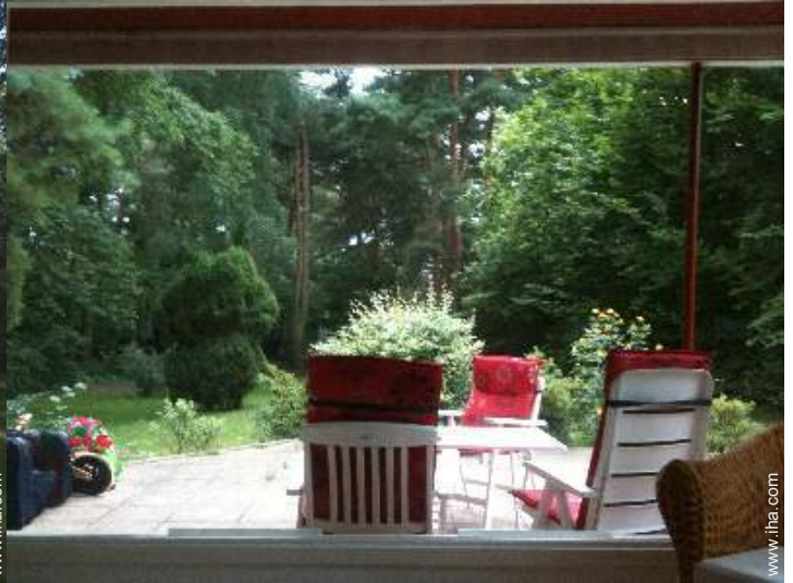
view from the living room