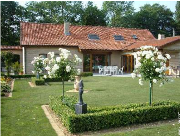
Outside at the guests disposal