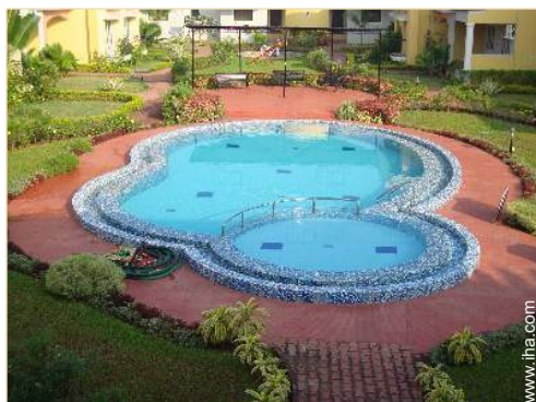
Original swimming pool