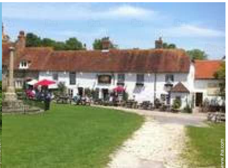
Cities close by