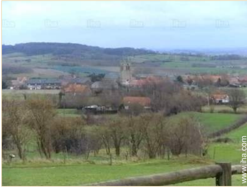
view of the village