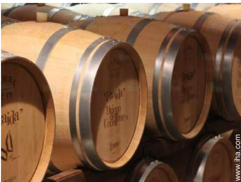
cellar and wine tasting