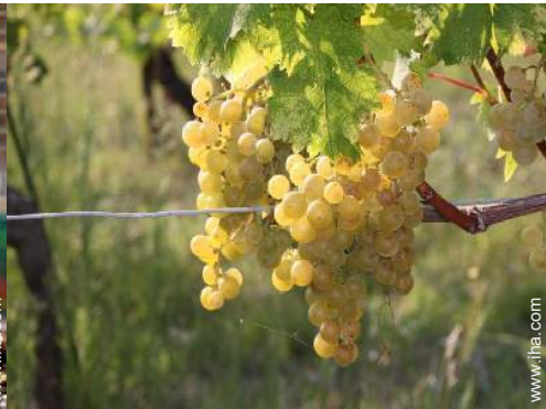
cellar and wine tasting