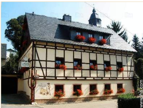
Luxury Tudor style house