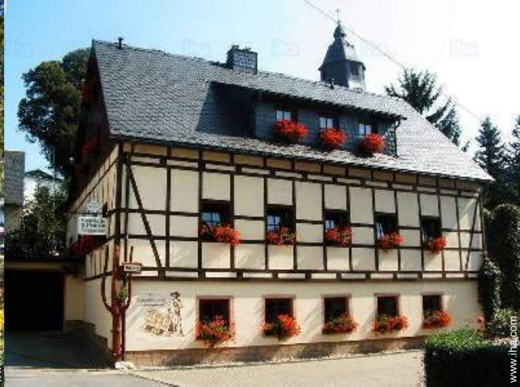
Luxury Tudor style house