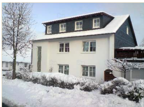
the apartment house/building