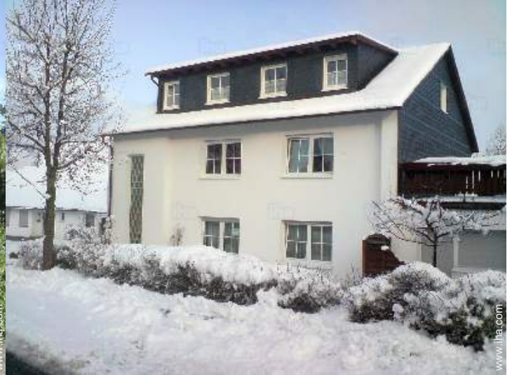
the apartment house/building