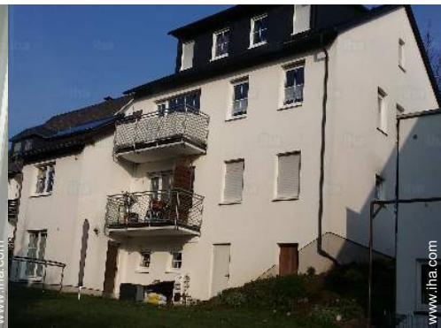
Single family home