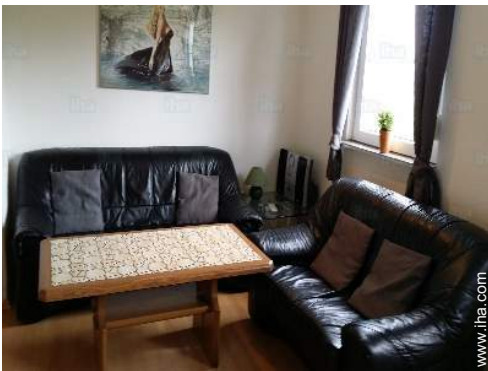
view from the living room