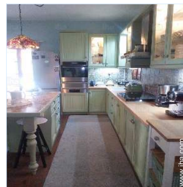
large american style kitchen