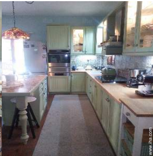
large american style kitchen