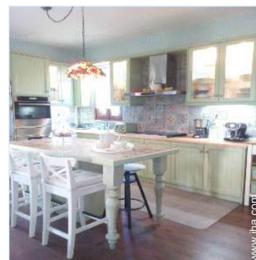
large american style kitchen