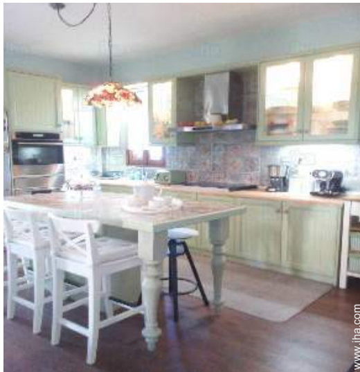
large american style kitchen