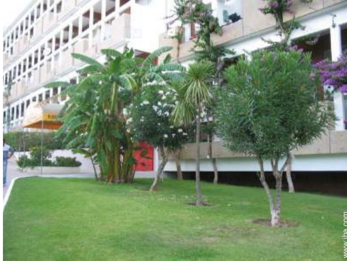
the apartment house/building