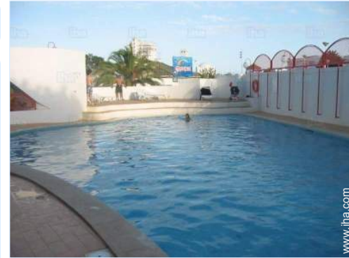
Original swimming pool