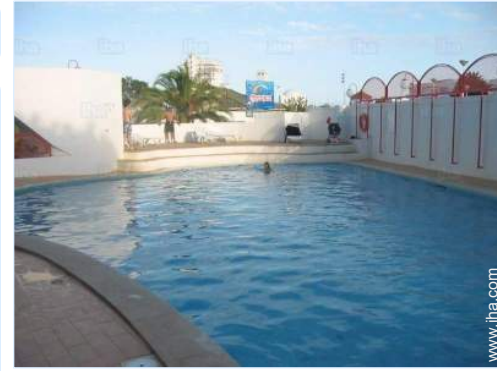
Original swimming pool