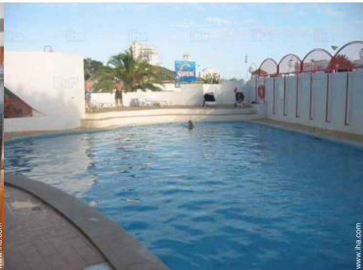
Original swimming pool