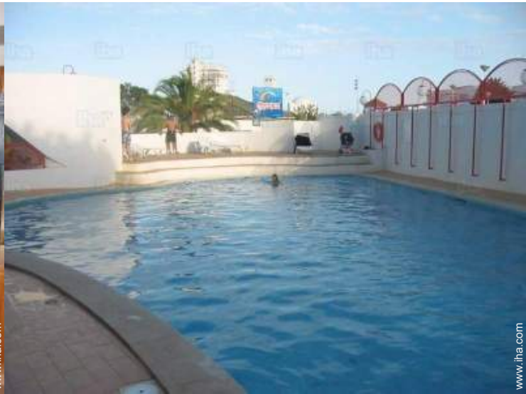
Original swimming pool