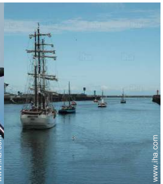
Cities close by