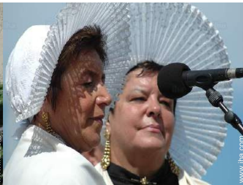
Attractions and relaxation