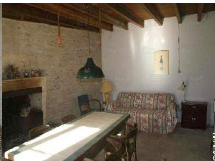
general floor plan