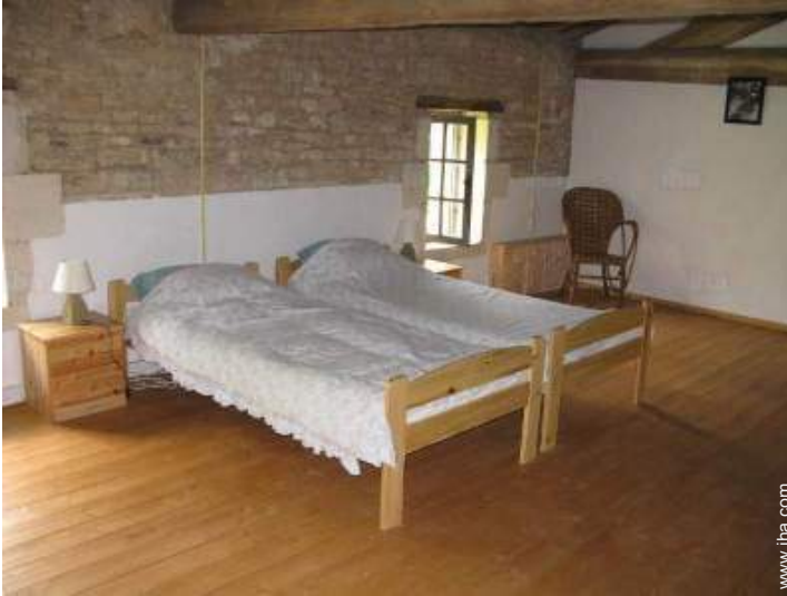
Sleeps - bed(s)