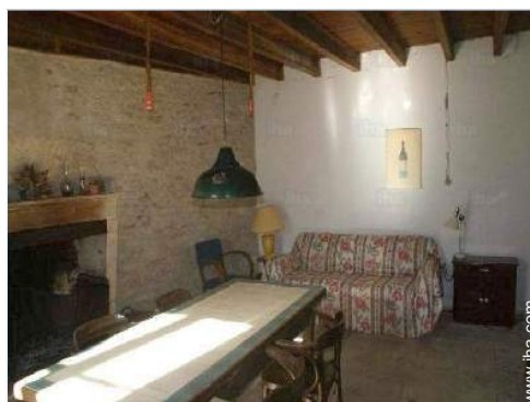
general floor plan