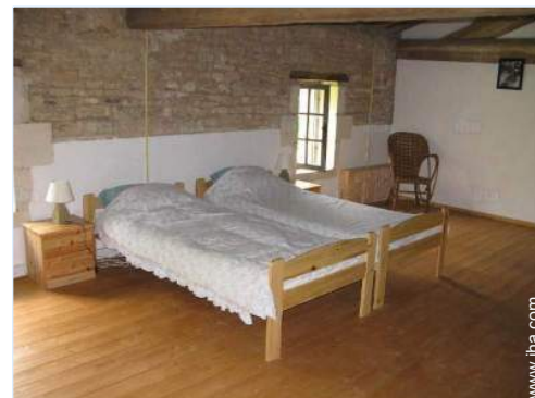
Sleeps - bed(s)