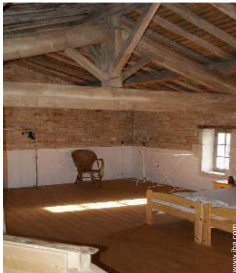
general floor plan