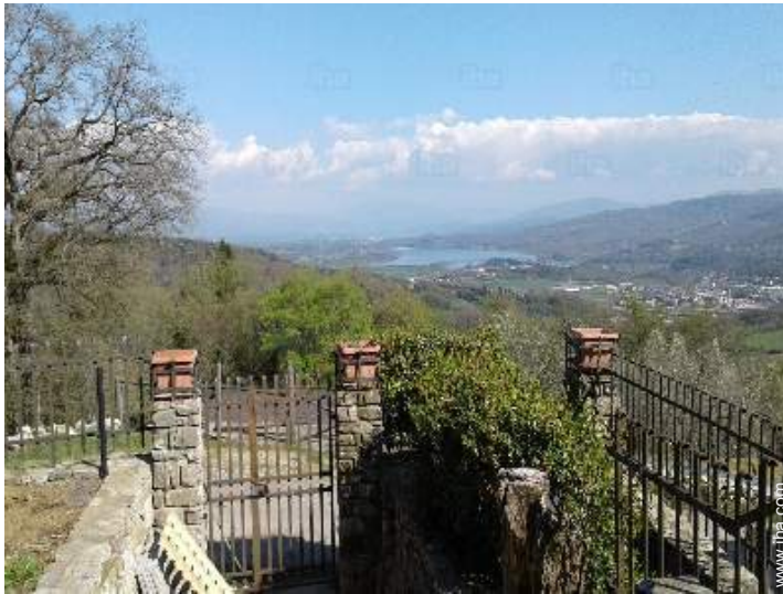
view over the lake