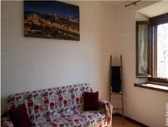
sleepers sofa(s) 2 pers