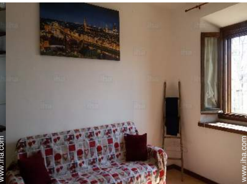
sleepers sofa(s) 2 pers