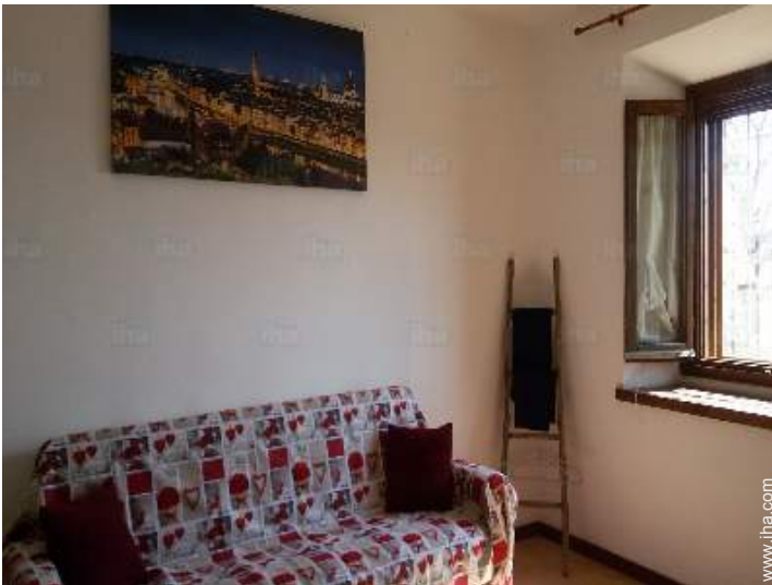
sleepers sofa(s) 2 pers