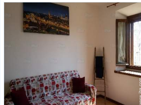
sleeper sofa(s) 2 pers