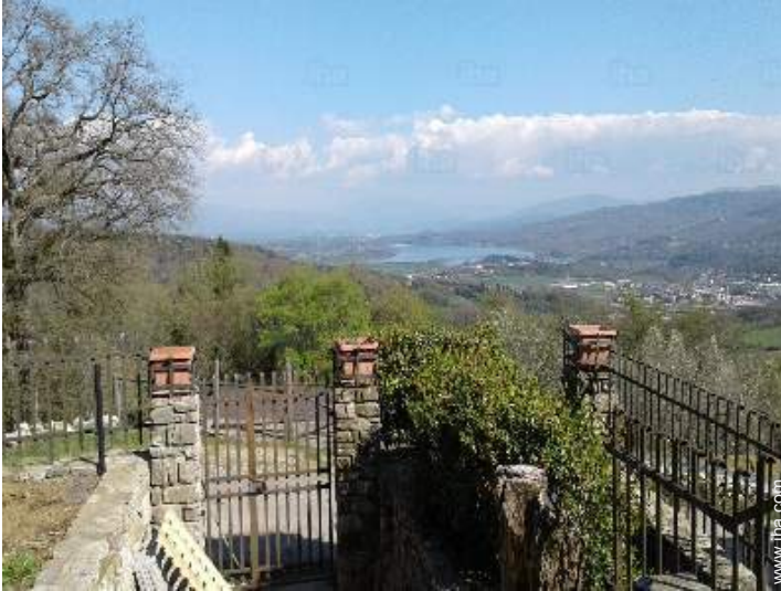
view over the lake