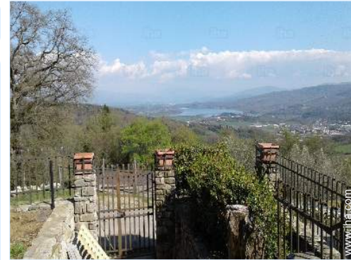
view over the lake