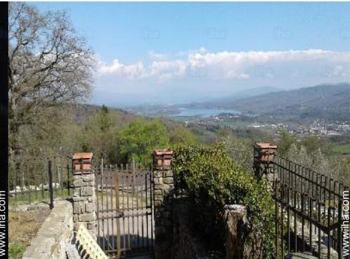
view over the lake