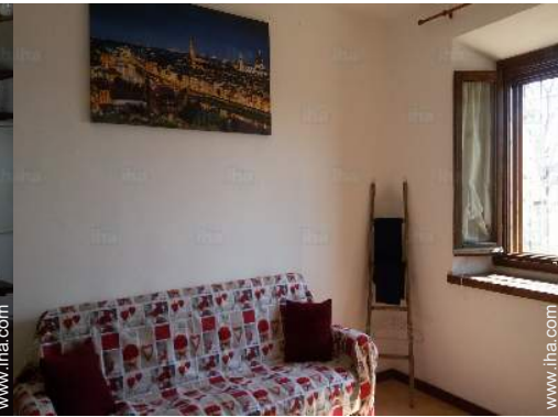
sleeper sofa(s) 2 pers