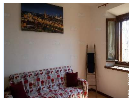
sleeper sofa(s) 2 pers