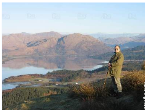
view over the countryside