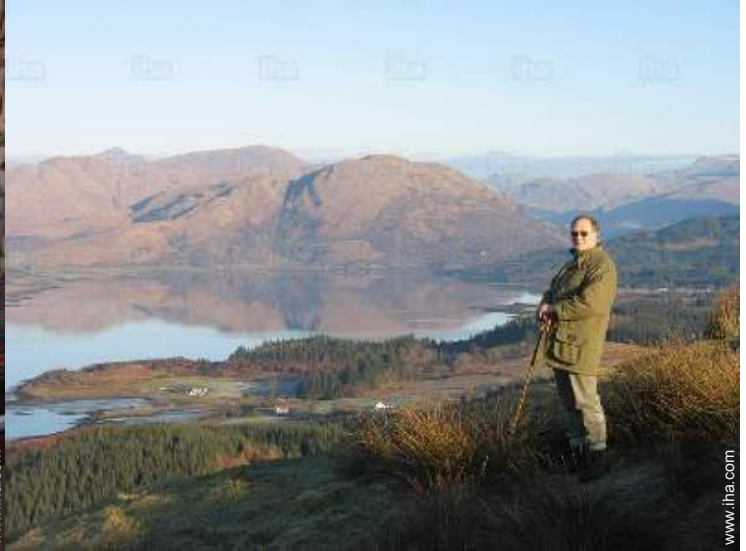
view over the countryside