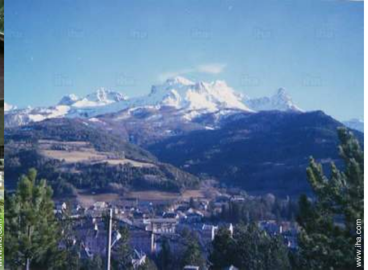
view from the apartment