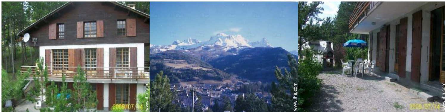
view from the apartment