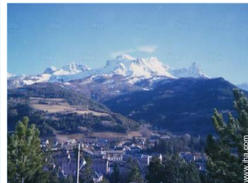
view from the apartment