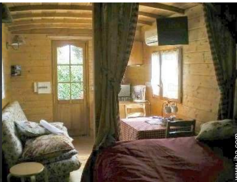
Guest facilities and furnishings