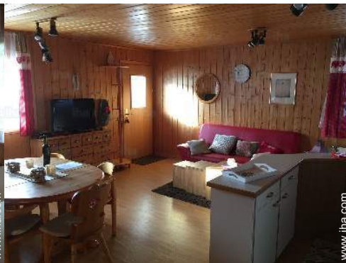
Guest facilities and furnishings