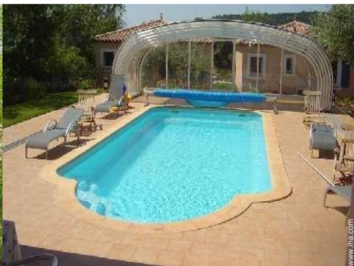
Rectangular swimming pool