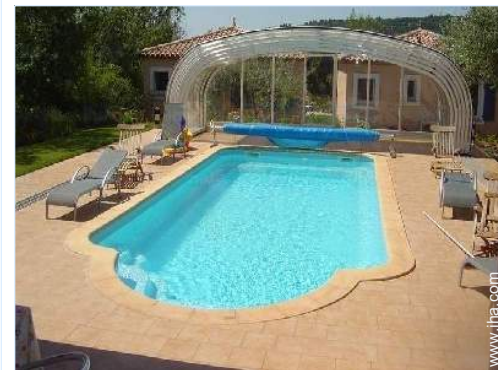
Rectangular swimming pool

Village center 660' Downtown 3mi. Bus stop / bus station 660' Car rental 15.5mi. Boat rental 9mi. Breadstore 660' Local stores 3mi. Supermarket 3mi. Hairdressing salon 3mi. Mail office 660' Bank 3mi. ATM 3mi. Drugstore 3mi. Doctor 3mi. Nurse <165' Hospital 15.5mi.