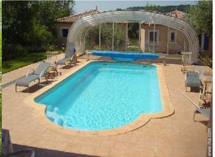
Rectangular swimming pool