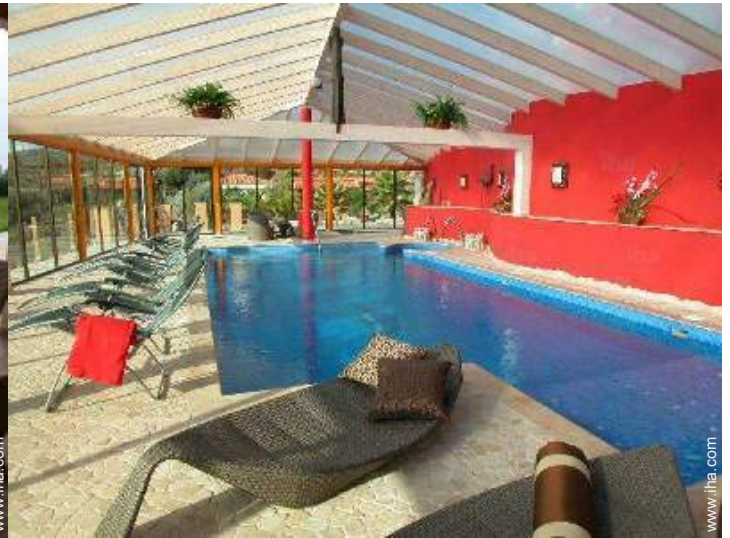
shared swimming pool