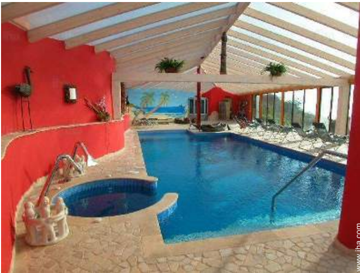
shared swimming pool