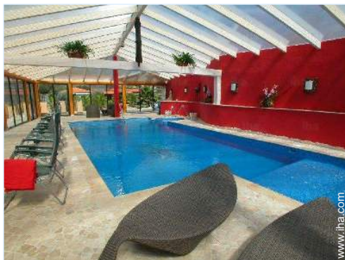
shared swimming pool