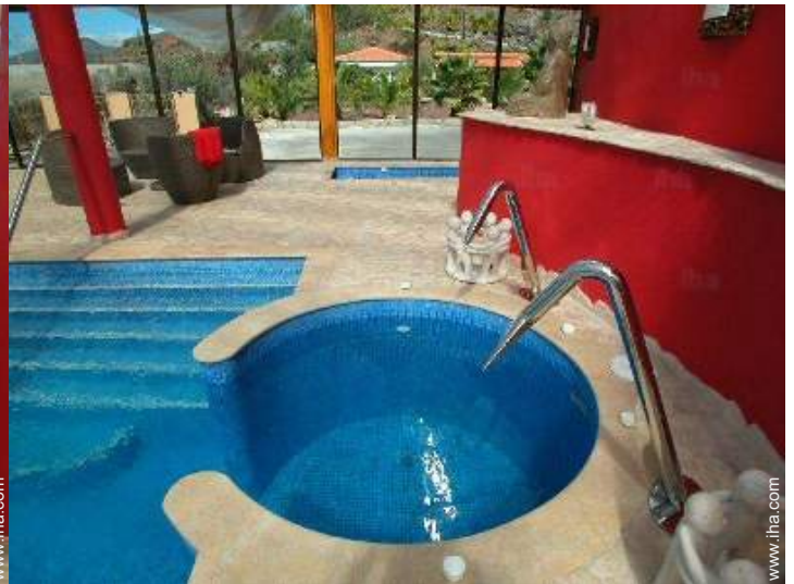
shared swimming pool