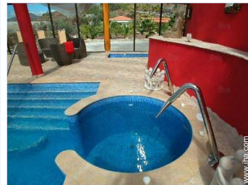
shared swimming pool