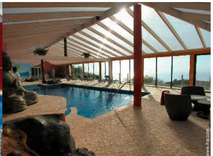
shared swimming pool