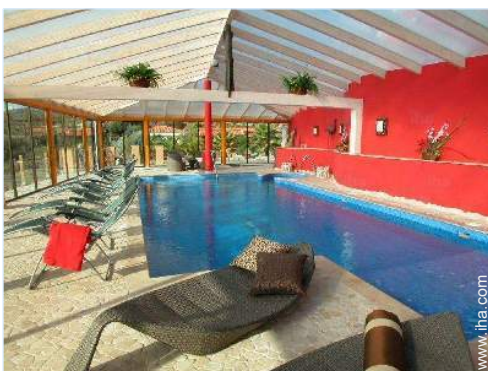
shared swimming pool