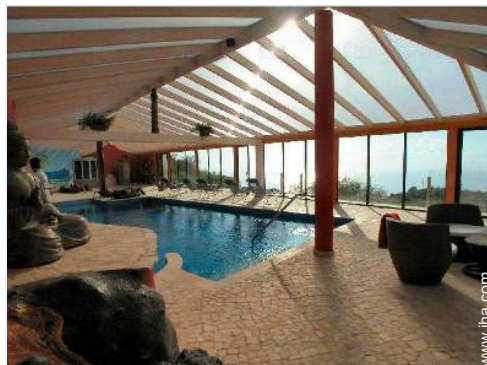
shared swimming pool