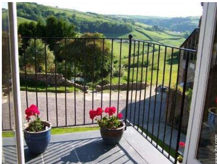
view over farmland