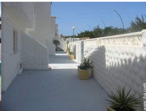
view from the kitchen