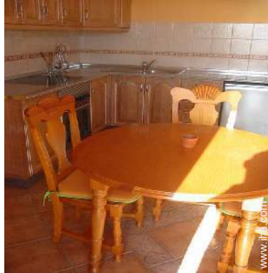
american style kitchen