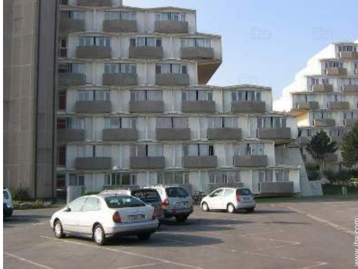
general floor plan