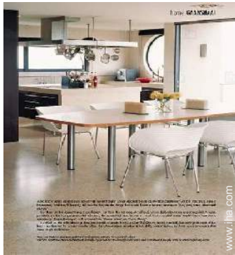
large american style kitchen