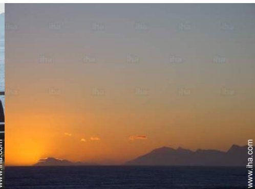
view over the ocean