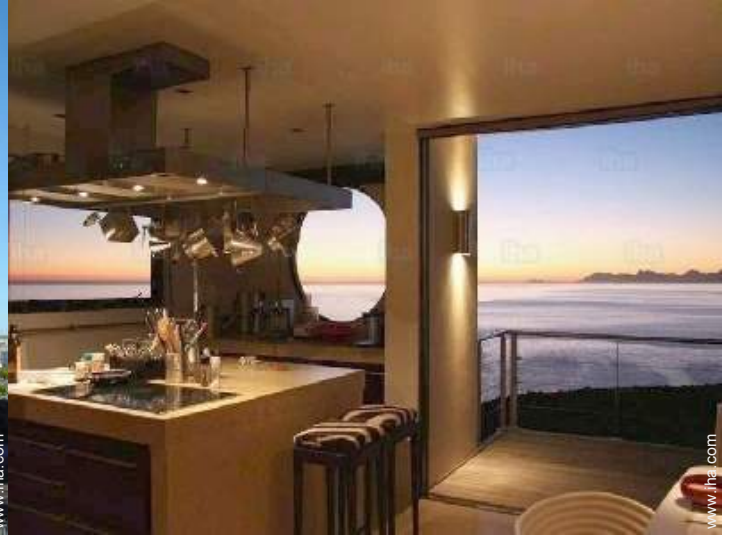
view of the sunset