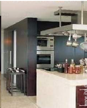
large american style kitchen