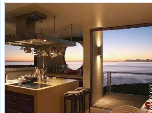
view of the sunset