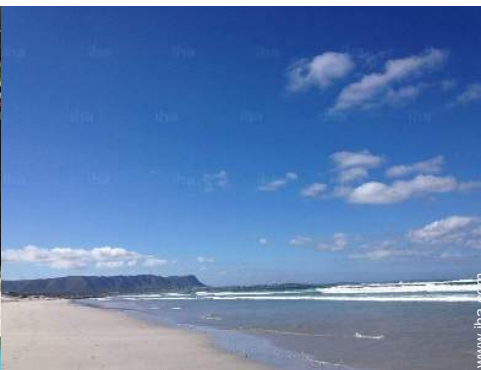
seaside pursuits nearby