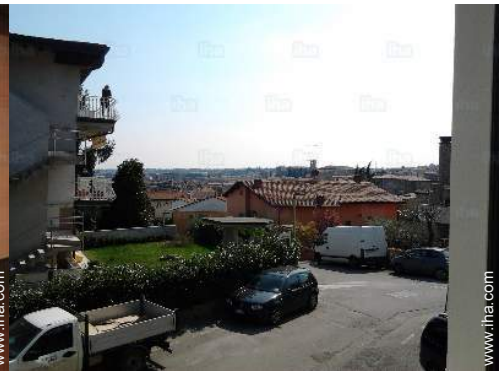
view from the house