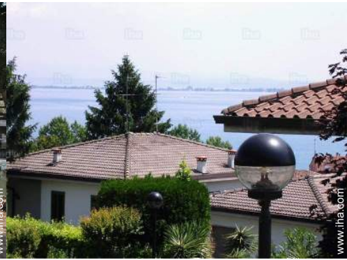
view from the bedroom