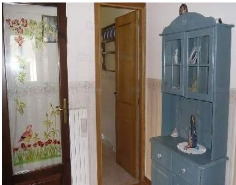
Interior layout at guests disposal