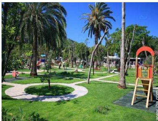
park and garden