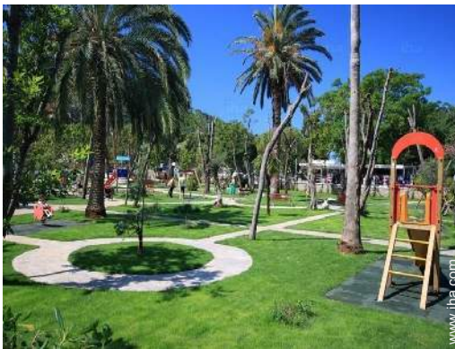
park and garden