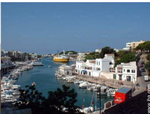
Cities close by