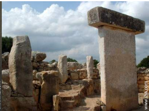
Attractions and relaxation