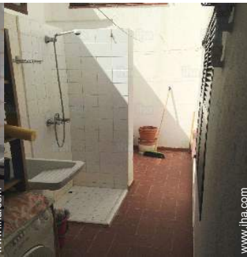
outside shower facilities