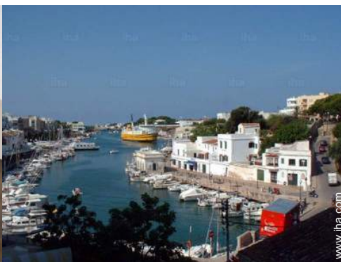
Cities close by