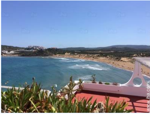
view from the apartment