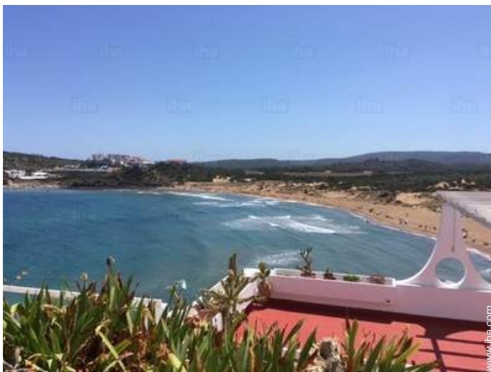
view from the apartment