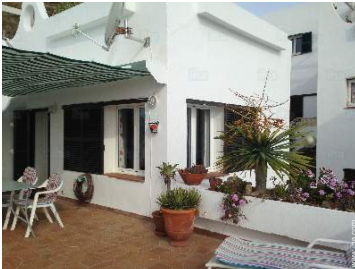
view from the terrace