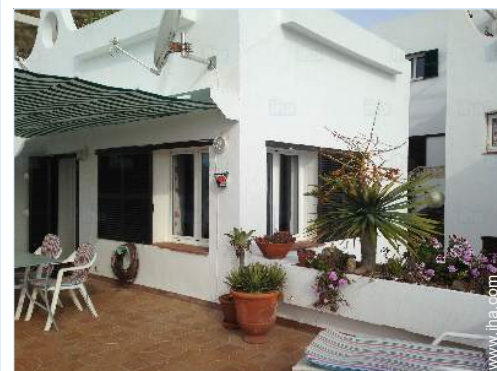
view from the terrace