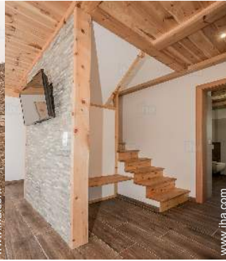
Guest facilities and furnishings