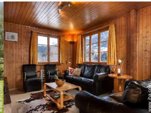
Interior layout and facilities