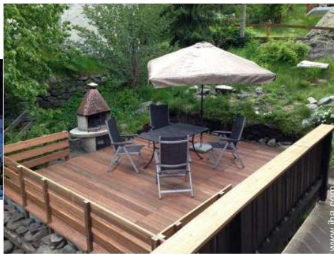
view over the mountain