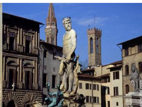
view of a monument