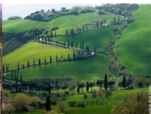
Attractions and relaxation