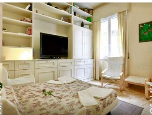
sleeper sofa(s) 2 pers