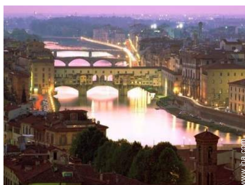
view of the city