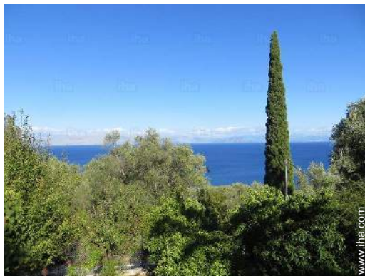
View from the property