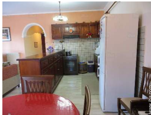
view from the living room