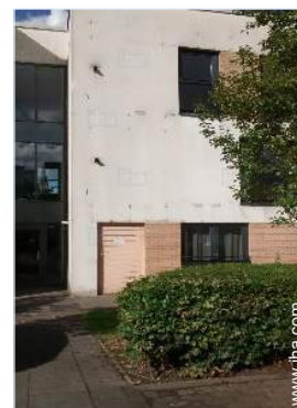
the apartment house/building