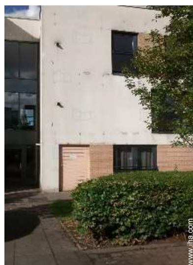
the apartment house/building