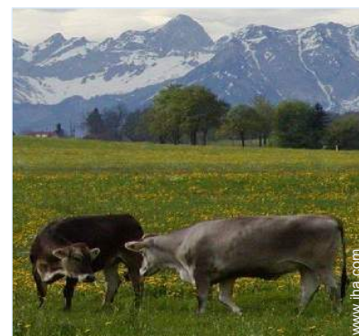
view over the mountain