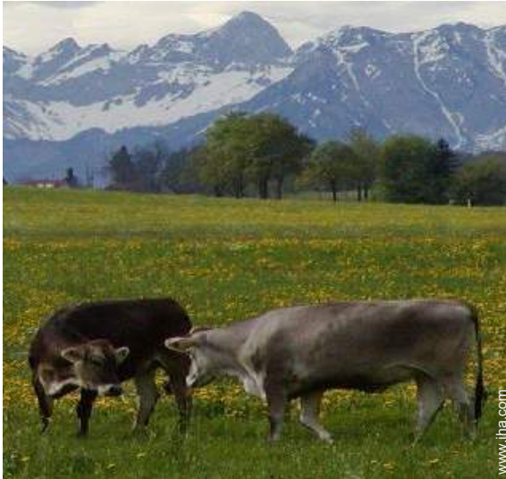
view over the mountain