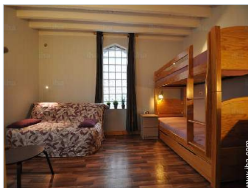
Sleeps - bed(s)