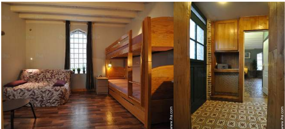
Sleeps - bed(s)