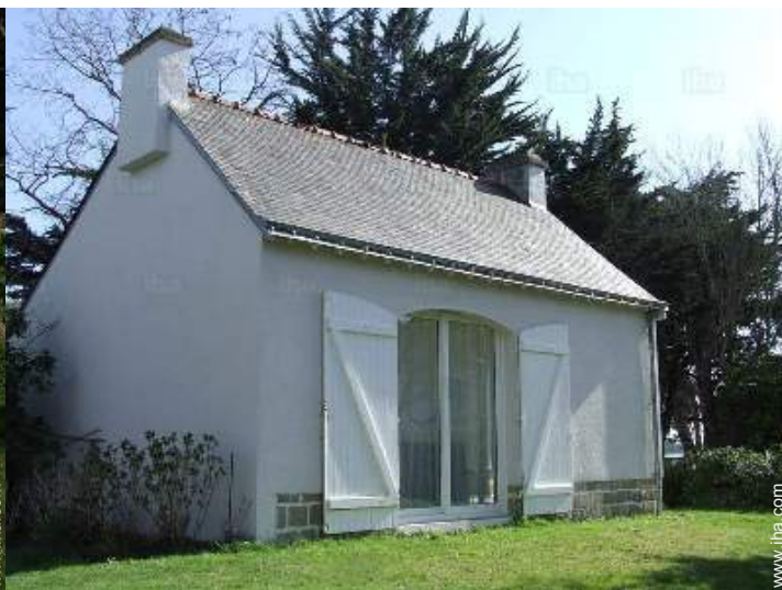
Outside at the guests disposal