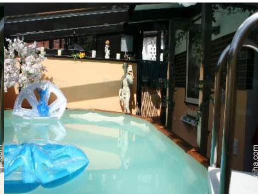
Heated swimming pool