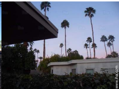
view from the patio