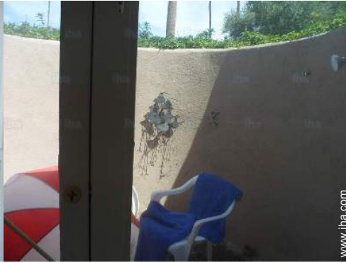
view from the bedroom