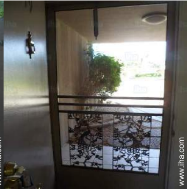
view from the apartment