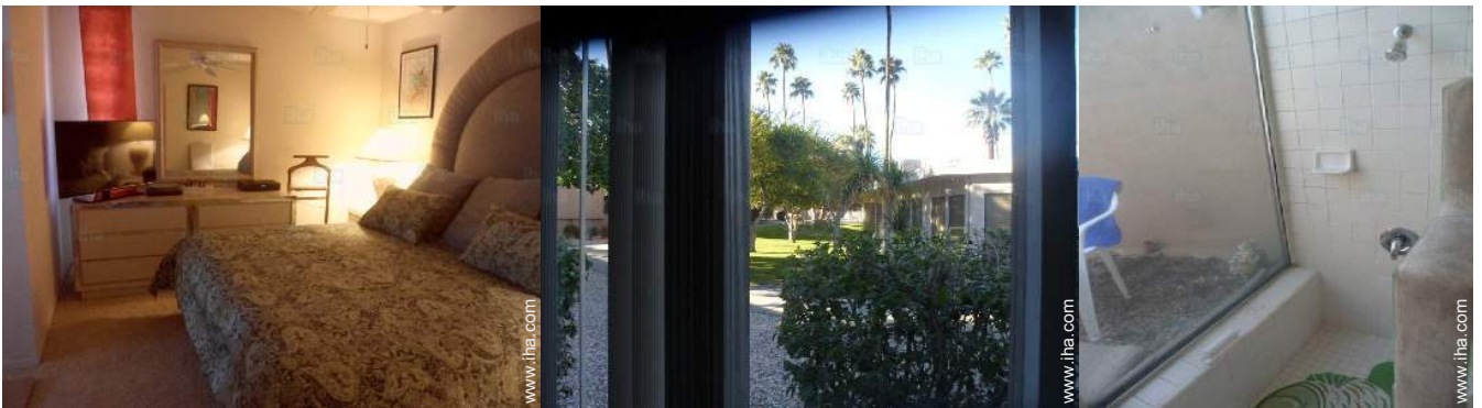
view from the house