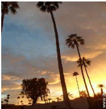
View from the property