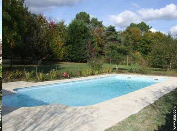
private swimming pool