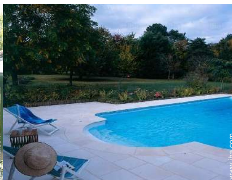
private swimming pool