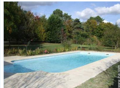
private swimming pool